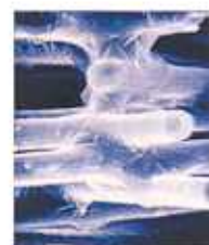
Cross section 10µm