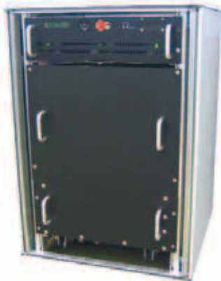
By courtesy of P21